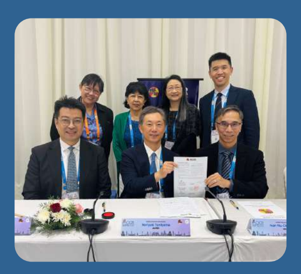
#Team HK - We look forward to welcoming everyone in AOCR 2028!

A big thank you to all the contributors and I hope you will enjoy this issue as much as I do!