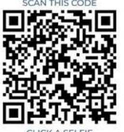
CLICK A SELFIE U-Code: 8IP*1K